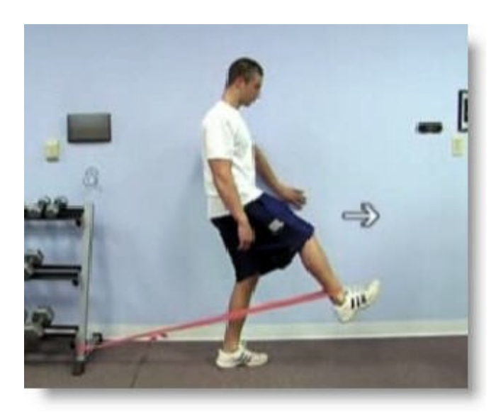
The Thigh Flexor Exercise from the video

Note: You will be exercising your right and left thigh flexor muscles three times each per day. That's it. No more, no less. And do them on the days numbered 1, 3, 5, 8, 10 and 12 as shown on the chart below: